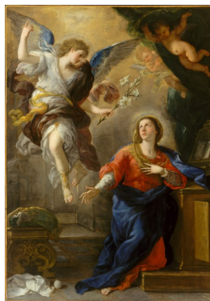
The Annunciation by Luca Giordano