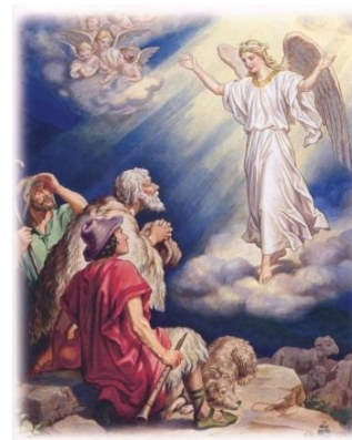
Angels visit the Shepherds