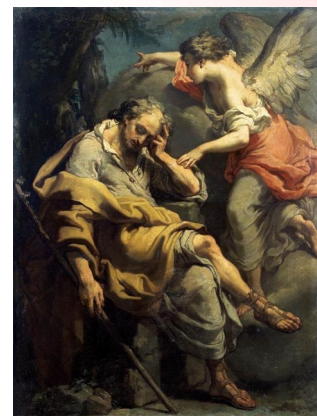
Joseph's Dream by Gaetano Gandolfi