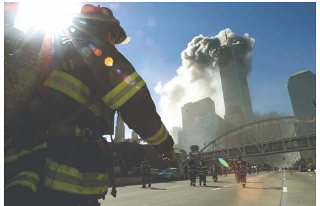
Photo: New York City firefighters make their way to the World Trade Center in lower Manhattan after the terrorist attacks of Sept. 11, 2001.

Taken from the September 6, 2021 Knightline