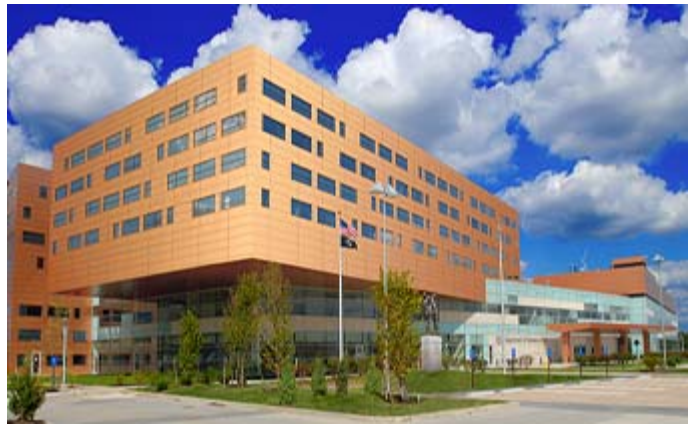
Chalmers P. Wylie VA Center

Without Volunteers, the Clinic cannot run successfully. They need men and women to donate 4 hours of their time, one day a week, to assist Veterans. Who better to assist Veterans than people who have the heart and compassion to help mothers? Please take that first step and call Voluntary Services at 257-5496.